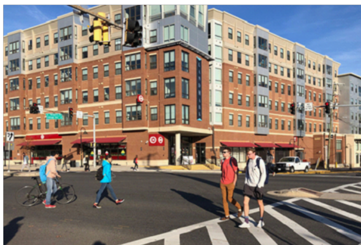
Route 1 Development, UMCP

As of June 30, 2020 and 2019, unfunded commitments within the private investments measured at NAV equaled approximately $328 million and $363 million, respectively.