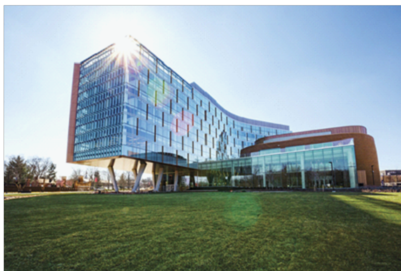
Brendan Iribe Center, UMCP