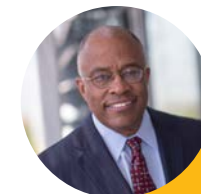
Kurt L. Schmoke